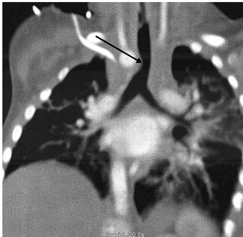
Figure 2. MSCT angiography. The right aortic arch with compression of the trachea.

chest retraction, tachydyspnea and tachycardia. Respiratory symptoms did not respond to medication and tracheal intubation was performed again. Two days later, we extubated him again and were once more faced with the same list of complications mentioned above. This prompted us to do an evaluation of why the extubations kept failing. First, a laryngotracheobronhoscopy was done. It showed extrinsic compression of the trachea at two levels (figure 1) and suggested the presence of a vascular ring. The next diagnostic step was to perform a thoracic CT with contrast. It showed atypical positioning of the descending aorta partly in the midline and partly parasagitally on the right and an impression on the dorsal contour of the trachea. The esophagus was sighted in the left parasagital space.